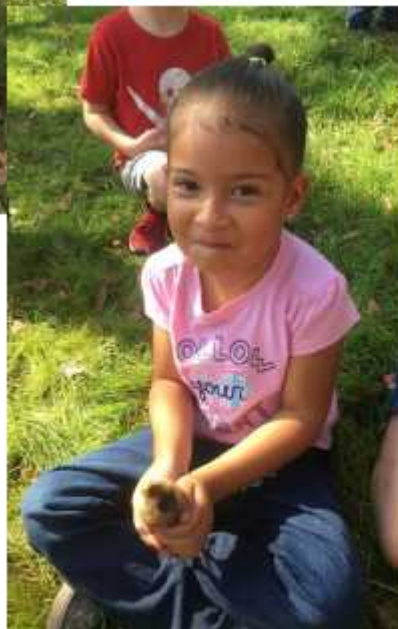
VPK Filed Trip: A Day On The Farm